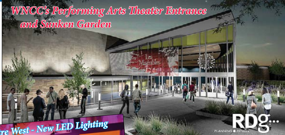
WNCC's Performing Arts Theater Entrance and Sunken Garden

39 Years "A Tradition of Giving & Helping!"