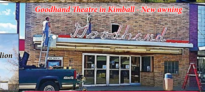
Goodhand Theatre in Kimball - New awning