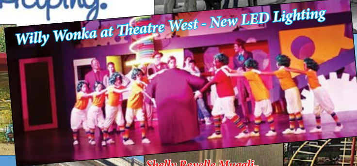
Willy Wonka at Theatre West - New LED Lighting