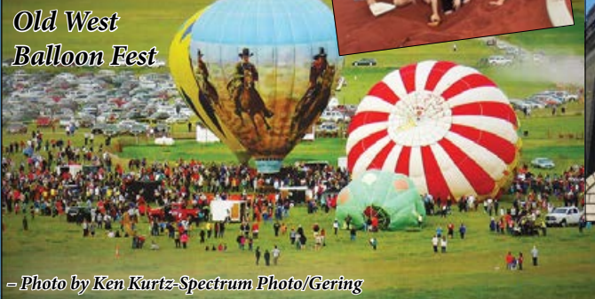
Old West Balloon Fest