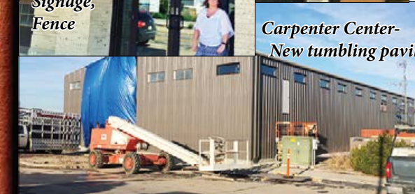
Carpenter Center - New tumbling pavilion