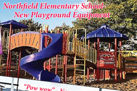
Northfield Elementary School - New Playground Equipment