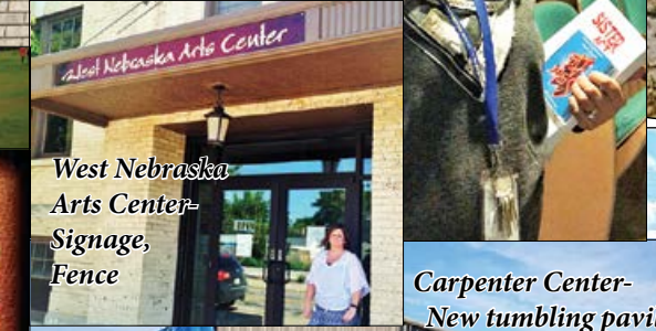
West Nebraska Arts Center - Signage, Fence