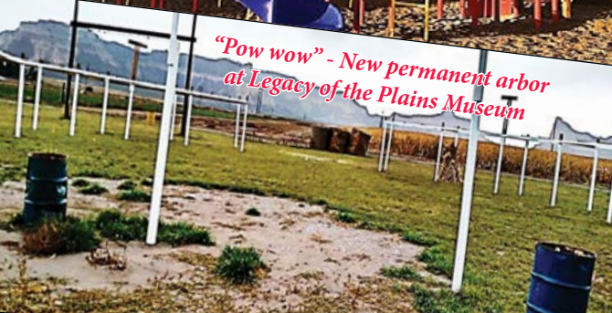
"Pow wow" - New permanent arbor at Legacy of the Plains Museum