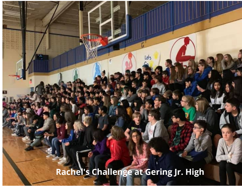
Rachel's Challenge at Gering Jr. High