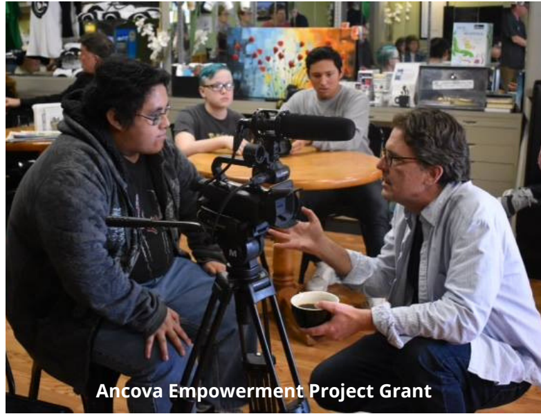
Ancova Empowerment Project Grant